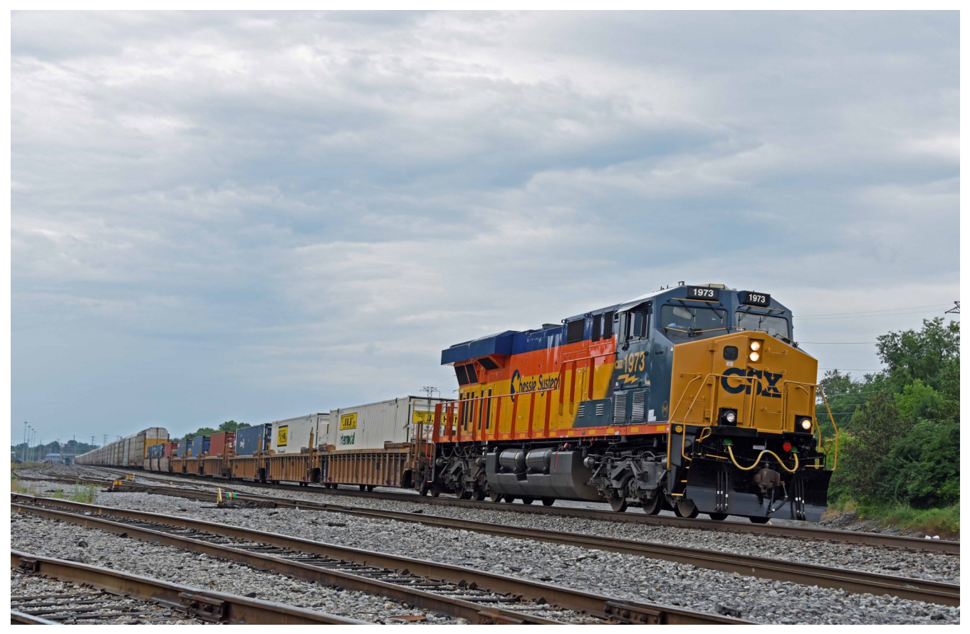
On July 3, 2023 in Wilsmere, DE, CSX Chessie System heritage unit is leading train M216 from Louisville to South Philadelphia. The heritage unit was unveiled to the public a couple of weeks earlier.