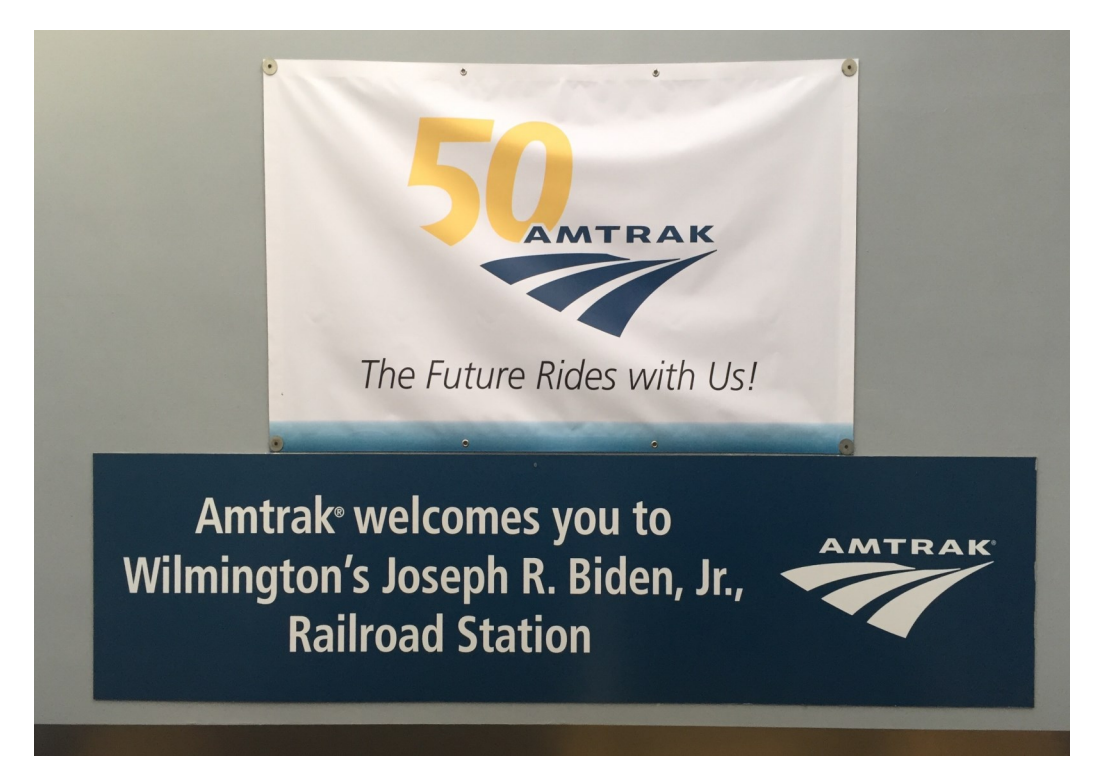
Amtrak didn't waste any time once 2021 came around posting a 50th Anniversary banner inWilmington.

President-Elect Biden was going to take a train from his namesake station to Union Station in Washington, DC but the plans were changed due to dramatically heightened security surrounding the inauguration.